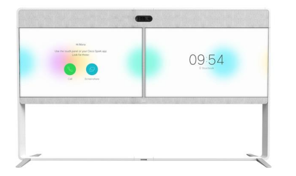
Figure 1. Cisco Webex Room 70 Dual and Cisco Webex Room 70 Single on Free-standing Floor Stand

The Room 70 – comprising a powerful codec, a quad-camera, and 70" single or dual 4K display(s) with integrated speakers and microphones – is ideal for rooms that seat up to 14 people. It offers sophisticated camera technologies that bring speaker-tracking and auto-framing capabilities to medium to large-sized rooms. The product is rich in functionality and experience but is priced and designed to be easily scalable to all of your conference rooms and spaces – whether registered on the premises or to Cisco Webex in the cloud.