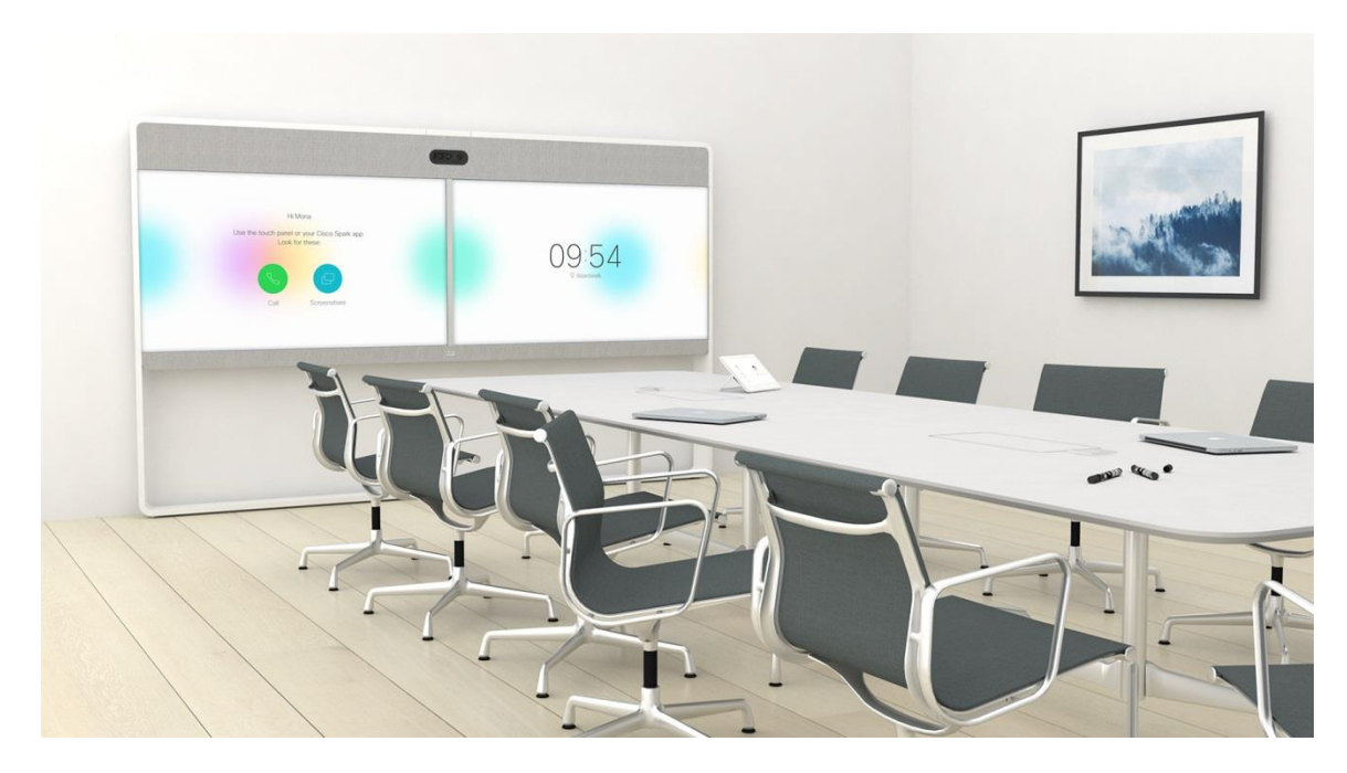
Figure 2. Cisco Webex Room 70 in large conference room